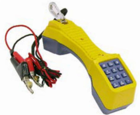
TS19 with angled bed of nails clips.....P/N CZ20019