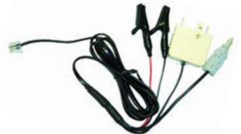
Optional multiway lead set .....P/N CZ2211