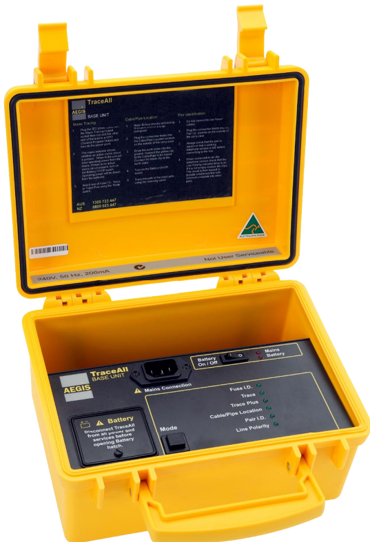
CZ1800 - TraceAll base transmitter